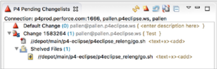
Figure 1: Shelving enables developers to store copies of open files temporarily in Helix Core without checking them in, offering a flexible way to get a snapshot of work-in-progress or reviewing code.

Shelving (figure 1) enables developers to cache modified files in Helix Core without checking them in. Shelving improves team collaboration and gives developers more flexibility in managing multiple projects.