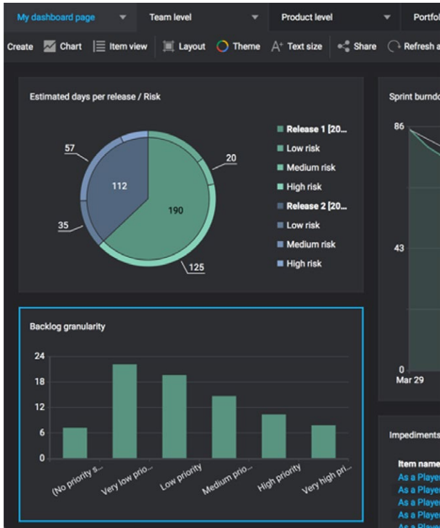
Real-time, highly customizable dashboards